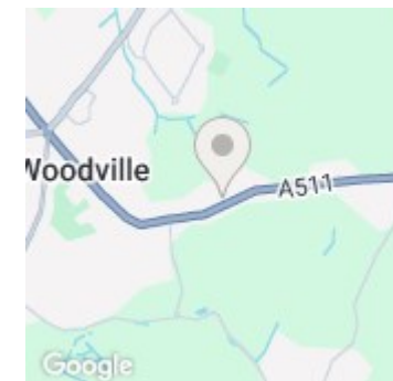
Illustration for identification purposes only, measurements are approximate and not to scale, unauthorised reproduction is prohibited

Approx. Gross Internal Floor Area 1,154 sq. ft / 107.20 sq. m (Including Garage)